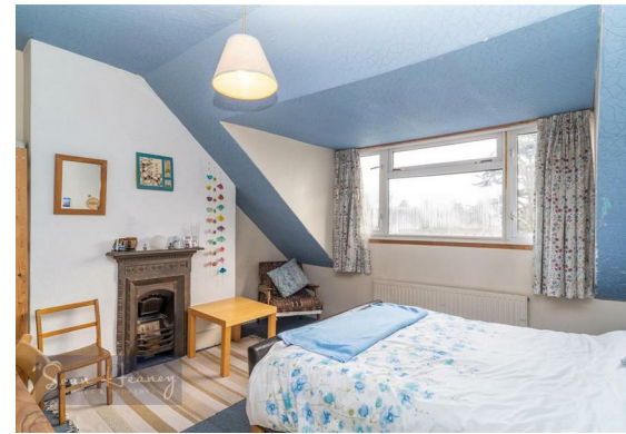
Bedroom 10'10" x 9'1" (3.30m x 2.77m)